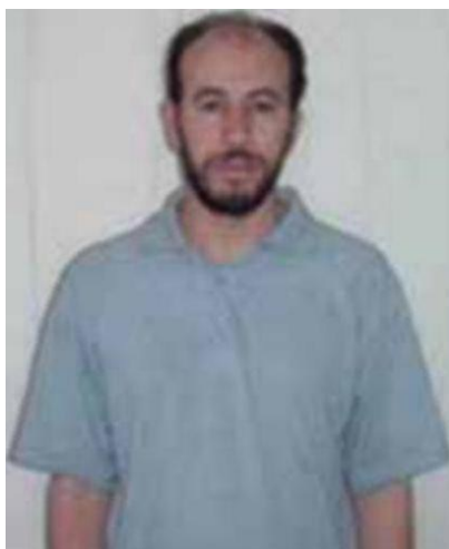
Photograph taken in 2000

Damaging an Aircraft; Unlawful Placing of a Destructive Device on an Aircraft; Performing an Act of Violence Against an Individual on an Aircraft; Hostage Taking; Murder of United States Nationals Outside of the United States; Attempted Murder of United States Nationals Outside of the United States; Causing Serious Bodily Injury to United States Nationals Outside the United States; Assault on a Passenger; Malicious Damage to an Aircraft; Use of a Firearm During a Crime of Violence; Aircraft Piracy; Aiding and Abetting; Conspiracy to Commit Offenses Outside the United States